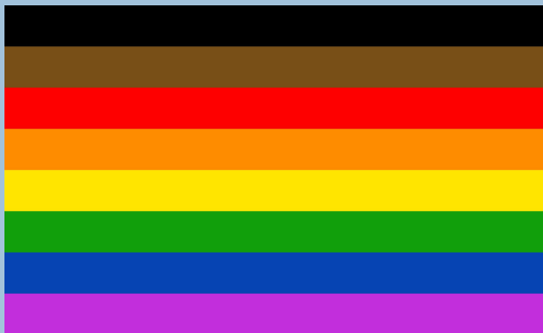
LGBT+ Pride Flag