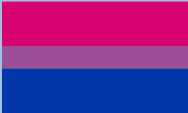
Bisexual Pride Flag