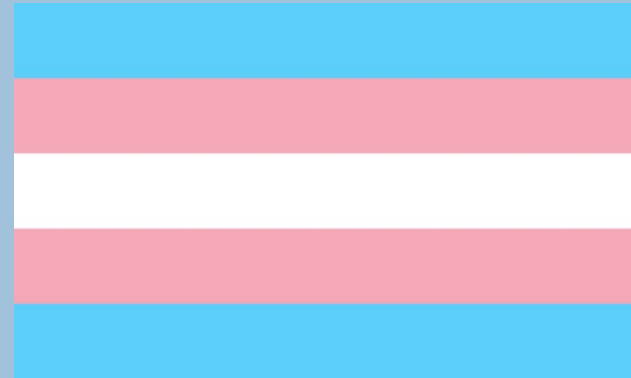
Trans Pride Flag