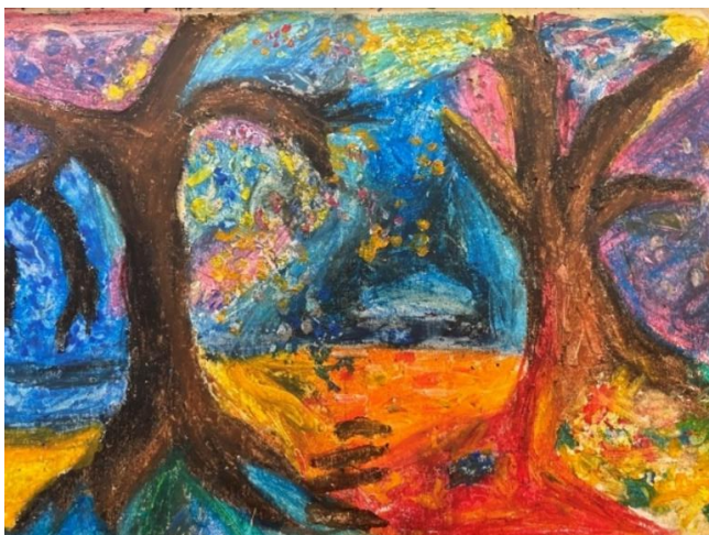
Fauvist landscape created using oil pastel.

Our artist of the week this week is Khalyla W (Ch7):