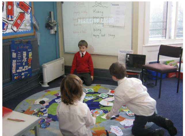
IQ have settled back into their new refurbished classroom