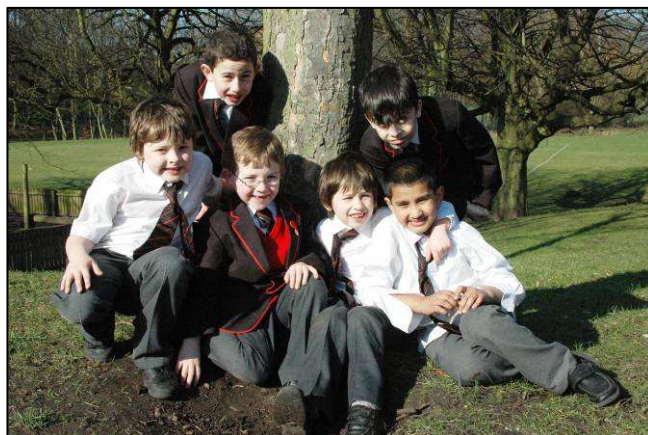
The Year 3 & 4 boys enjoy playing together in the grounds