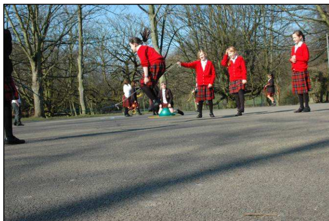
The girls skipping