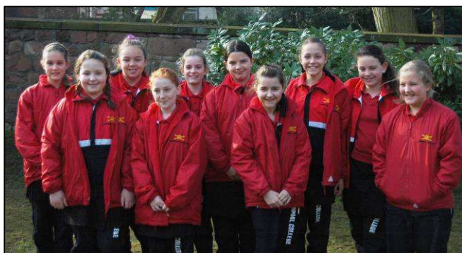
The Under 11 Netball team leave for the AJIS Tournament on Thursday