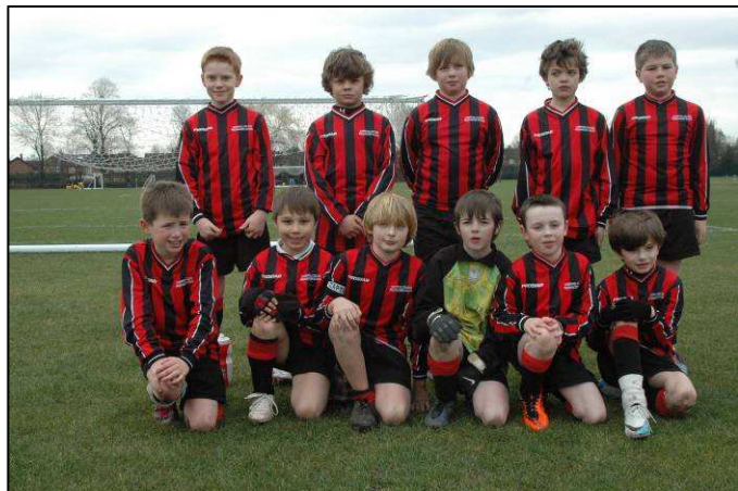
The U10 Squad