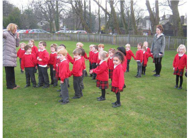
Reception children took advantage of the spring sunshine and had a walk around the grounds