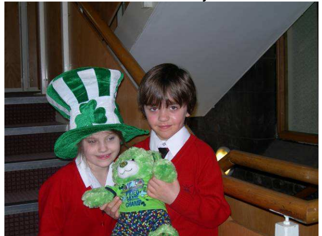
Two children from 2P brought a little Irish magic to class on Thursday.