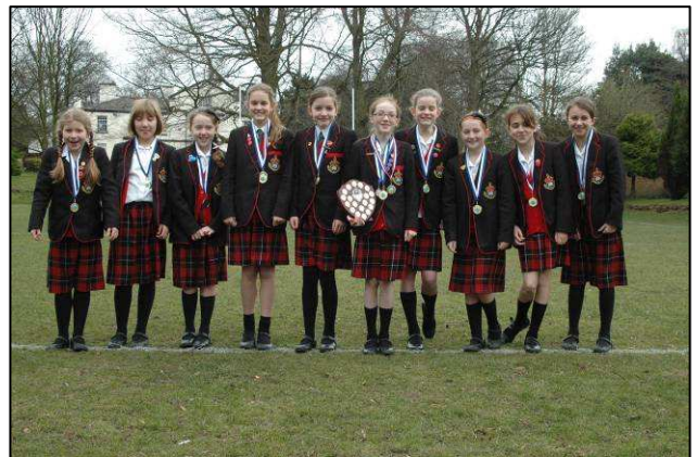
Girls' Cross Country Team - City Champions!