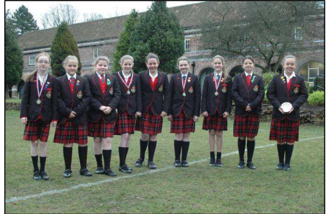
The Hockey team - winners of the North-west Budge Memorial Plate Competition at Rossall