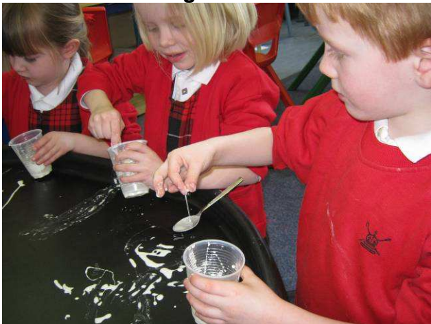
Reception 1 enjoyed becoming scientist for the afternoon when they explored the gloop they had made.