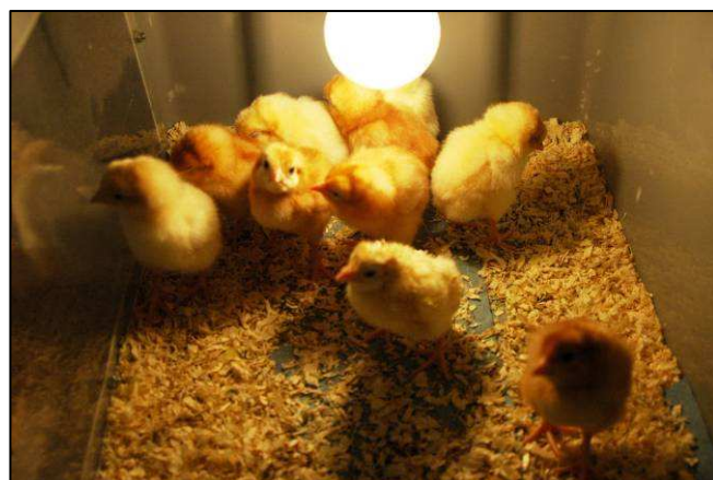
A busy brooder box – all 10 have hatched!!