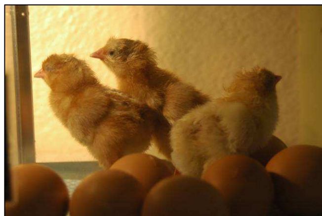
The first of our chicks hatch