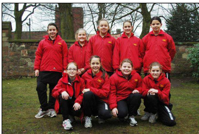
The Under 11 Hockey team leaving for the Stoneyhurst Tournament on Wednesday