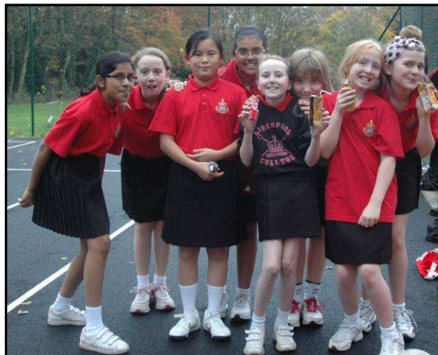
Under 11 'B' team