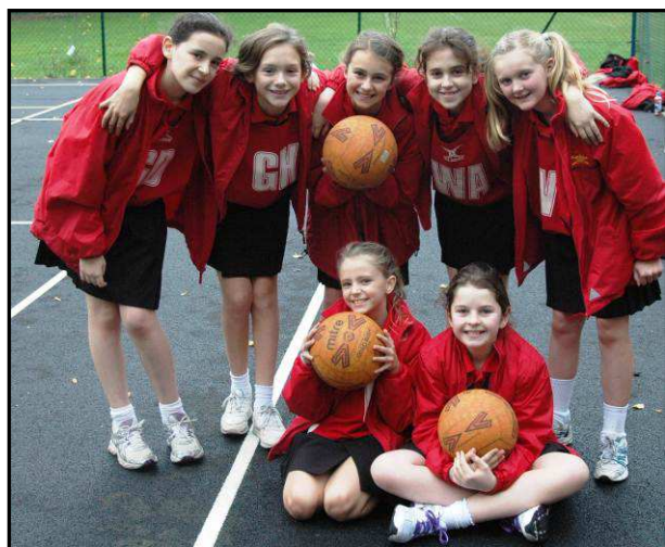
U11 'A' team