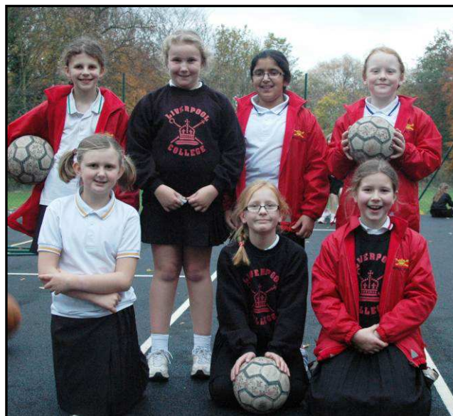
Under 10 Netball team