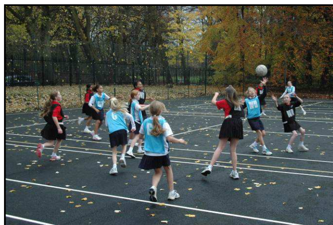
One of the Netball teams in action!