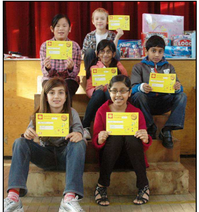
Gold Award Winners