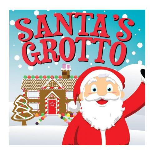
Notice to All Parents/Carers Christmas Grotto

If anyone has any cushions, rugs, throws or puppets at home that they no longer need it would be greatly appreciated if you could pass them into school for use in our Pre-prep library.