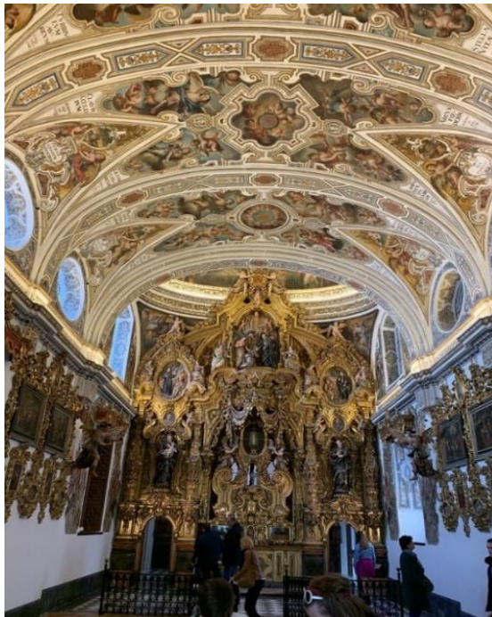
Church of Saint Louis of France

We commenced another day by visiting two churches – Iglesia del Salvador (Church of El Salvador) and Iglesia de San Luis de los Franceses (Church of Saint Louis of France). The first is a former mosque, turned baroque Roman Catholic Church with an elaborate altar and soaring nave. The latter is again a baroque Roman Catholic Church, but was built to remember the first brother of Ferdinand III, the King who reconquered Seville. Both churches gave us all a real understanding of how much work must have gone into their construction and design as both of the churches were beautifully designed.