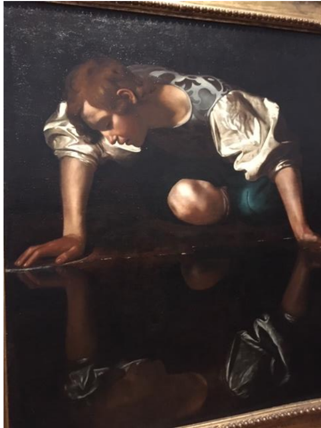
Narcissus, 1599 by Caravaggio

A phenomena that is unique to this generation of youngsters is the taking of selfies. These framed and adjusted poses is not unique to our children. Whilst in the Rijksmuseum we had the good fortune to view some of the great works by Michelangelo. The painting which resonated with me as a parent and the Head of Sixth Form was the painting of Narcissus. This is an example of the very first selfie!