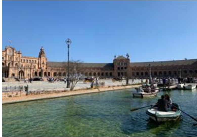
Plaza de España

After lunch and several hours of free time, we walked to the Plaza De España – this is a plaza in the Maria Luisa Park, built in 1928 for the Ibero-American Exposition in 1929. It is a landmark example of different cultural and architectural designs. We could clearly see that the architecture reflected the Baroque Revival, Renaissance Revival and Moorish Revivals that had taken place in Seville and Andalucia.