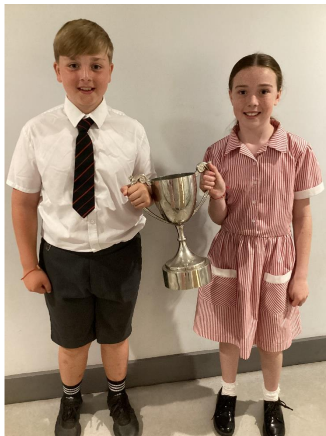
Well done to Howards for winning the House Point Cup