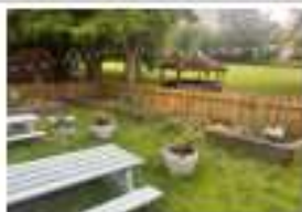
The Garden Before Enrichment